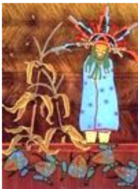
Polik Mana Watching The Frogs Go By