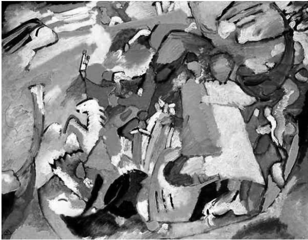
ALL SAINTS DAY (by Wassily Kandinsky, 1911)