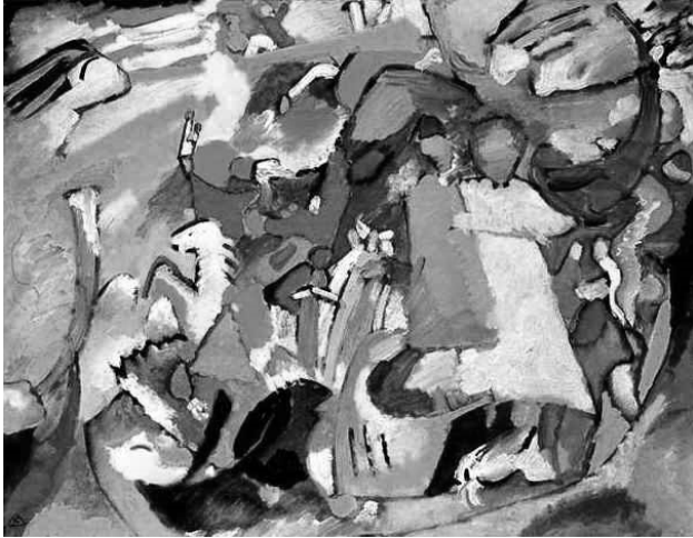
ALL SAINTS DAY (by Wassily Kandinsky, 1911)