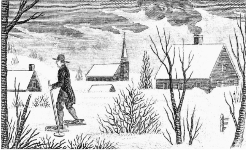
National Historic Society, "Great Snow of 1717"