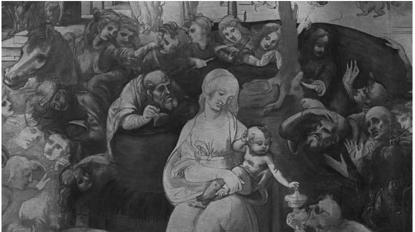
Leonard DiVinci, Adoration of the Magi , Unfinished Oil Painting, 1481