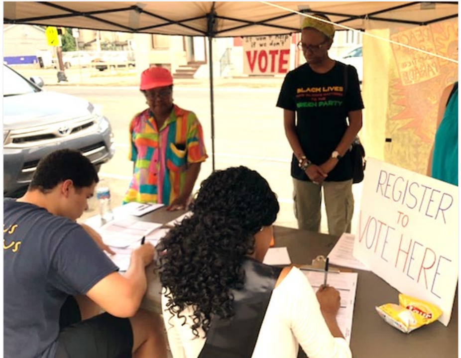
Top: Arch Street’s POWER volunteers helped sign people up to vote at the Serenity House Labor Day BBQ.

Outreach participation by the members of Arch Street UMC and our POWER volunteers proved that standing together in faith and unity for the greater good always brings the best out of anyone that’s willing to put forth the effort. I was proud to be a part of it. Keep a lookout for more upcoming events sponsored by Arch Street UMC and our POWER LOC in the near future!